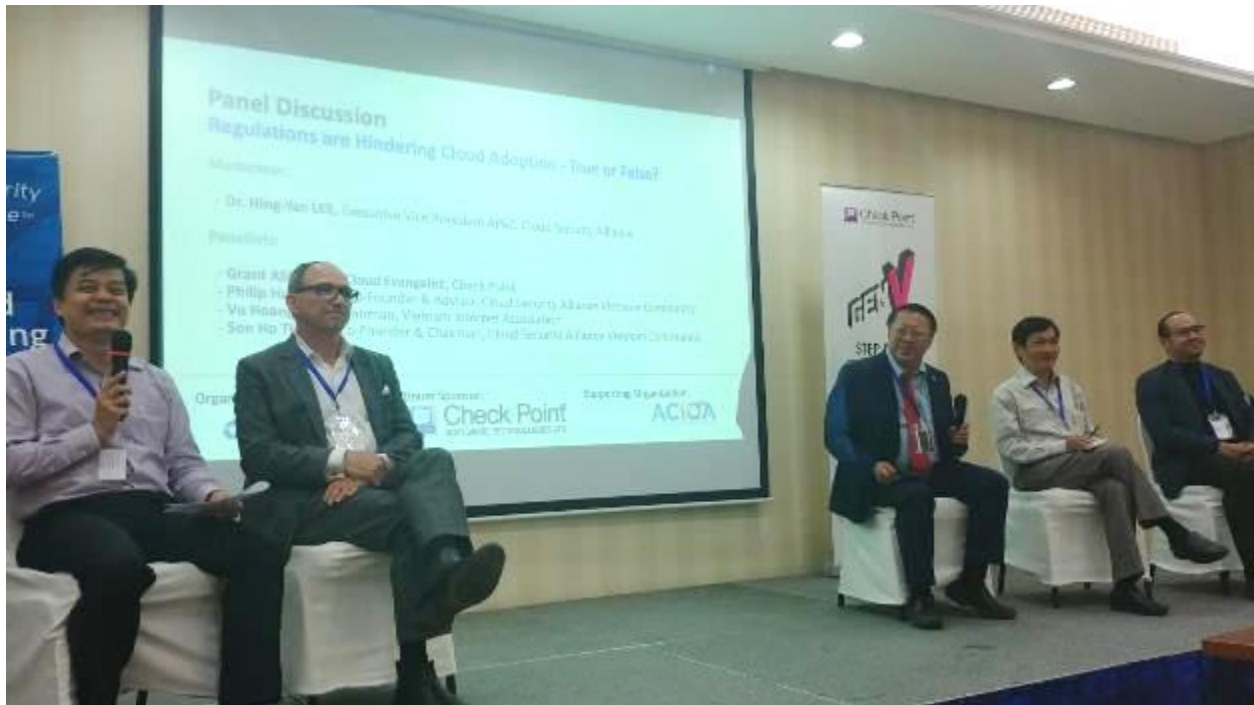
Panel Discussion on “Regulations are Hindering Cloud Adoption – True or False?”