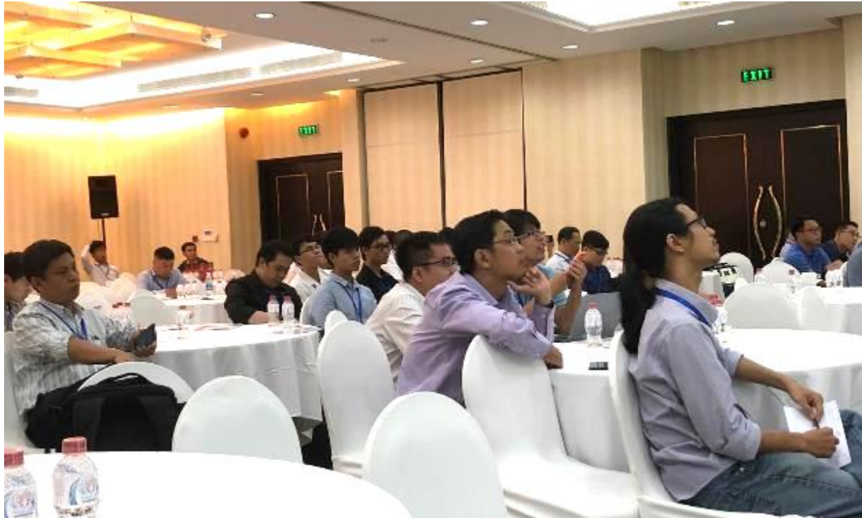
Part of the crowd at CSA Vietnam Summit 2019