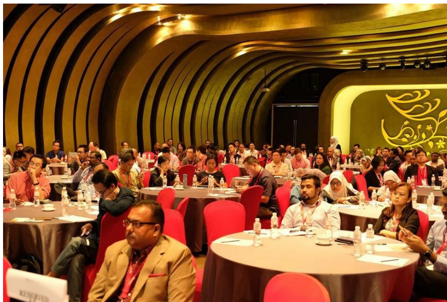
The audience in rapt attention at the Summit