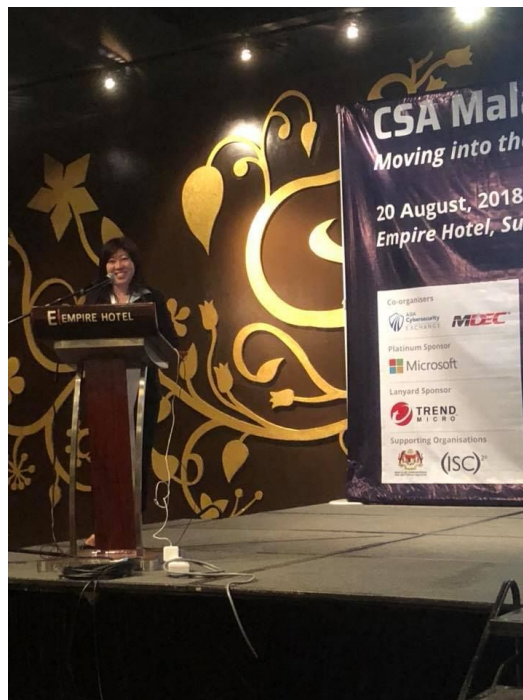
Dato' Wan Peng NG (COO, MDEC) giving the keynote address on “Digital Malaysia as the National Digital Transformation Initiative”