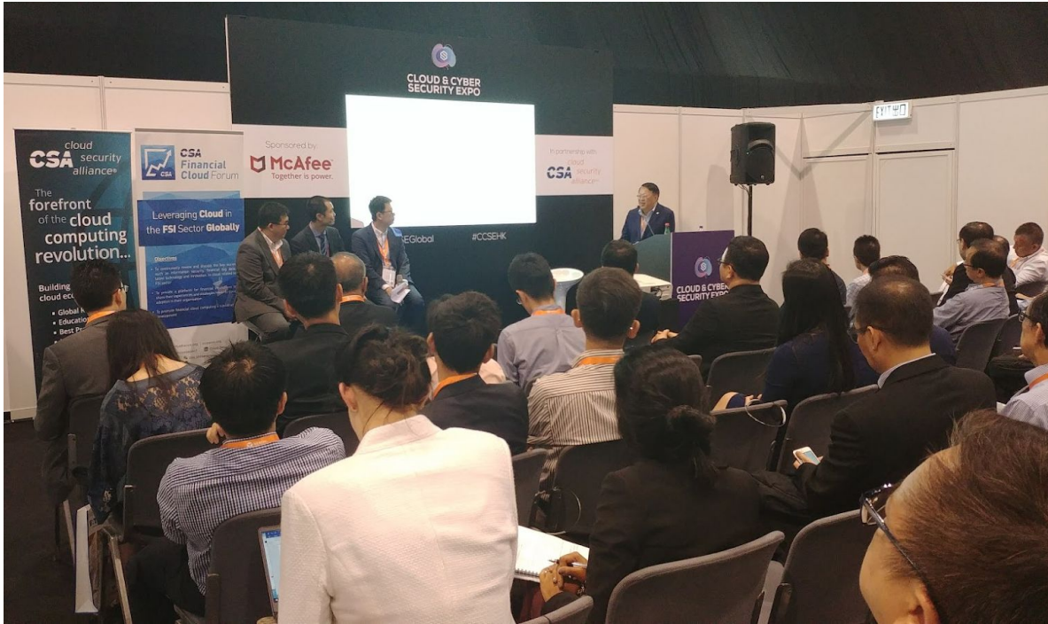
Panel discussion on 'Leveraging the Cloud for Fintech Services'