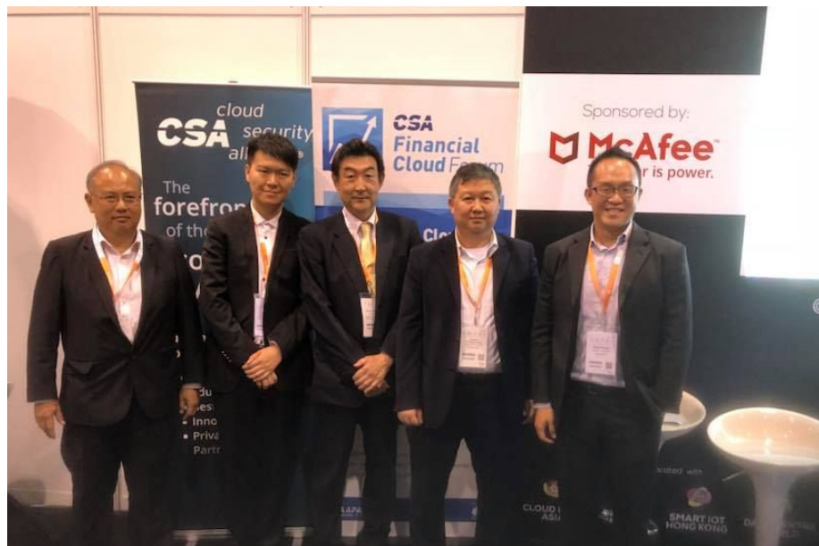
Panel discussion on 'Cloud Adoption: Are You on the Offense, Defence or on the Sidelines?'