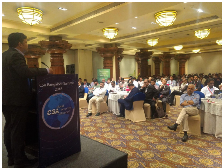
Audience at the Summit