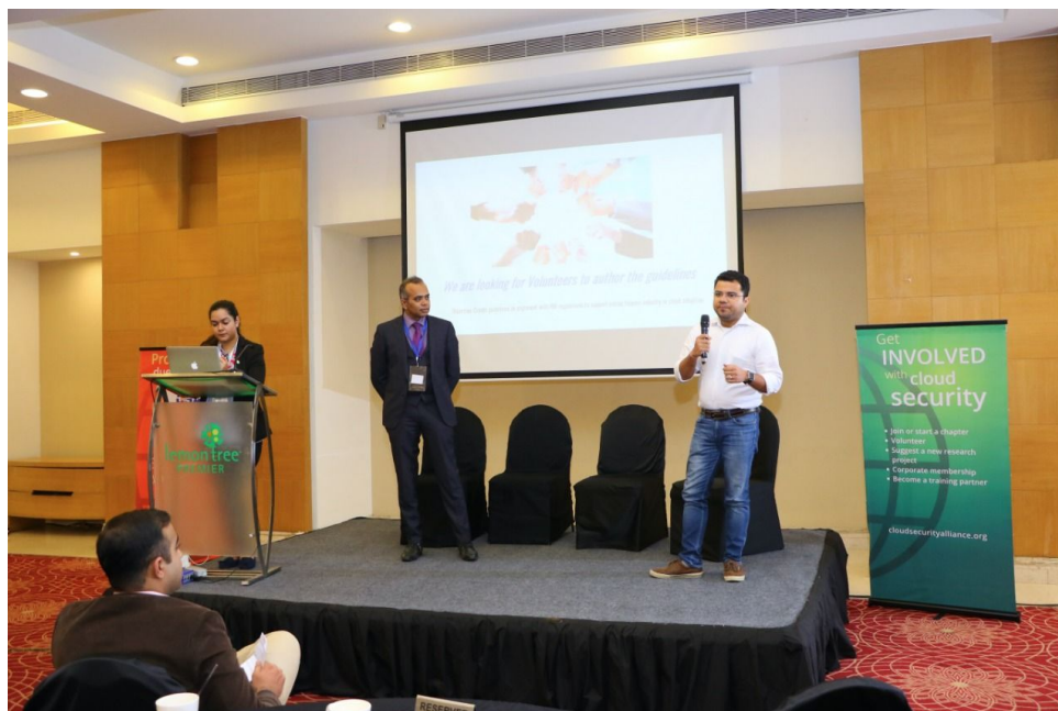
"A Call to Action – To the India Cloud Community" to join the CSA Hyderabad Chapter