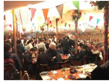
SC27 delegates at the gala dinner!