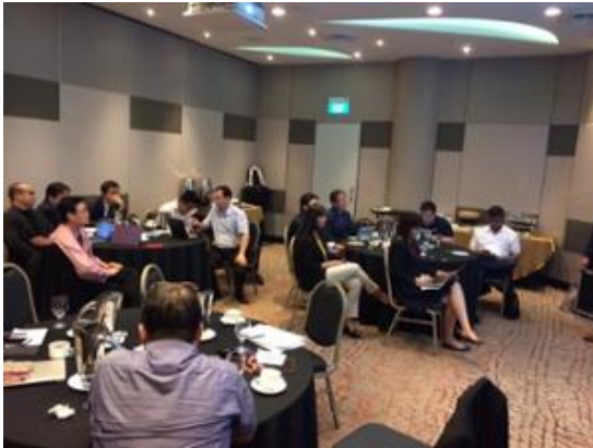
5th Annual CSA Chapter Leadership Workshop hosted on 11th April 2017 in Singapore.