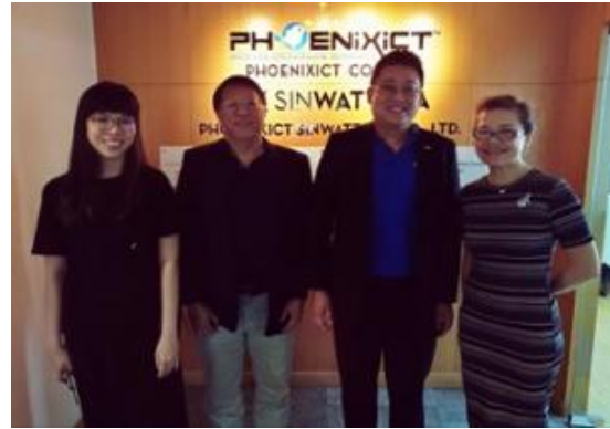
CSA visit to Phoenixict in Thailand on 4th April 2017