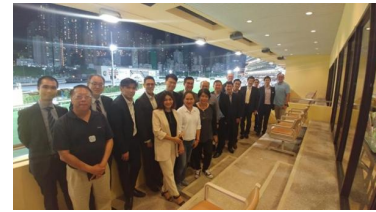
A group photograph of the CXO Dinner attendees at The Hong Kong Jockey Club