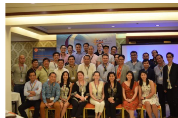
Participants at the CSA Philippines Cloud Security Tour

This event was the first leg of the chapter’s programmatic effort to discuss and align initiatives with public and private sectors in developing Cloud Security landscape in the country.