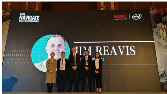
Jim Reavis (CEO, CSA) speaking at Xinhua San Group's Navigate 2018 with theme "Future Digital Future" at New International Convention & Exposition Center in Chengdu Century City