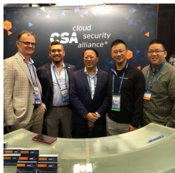
CSA Taiwan chapter leaders visiting CSA booth