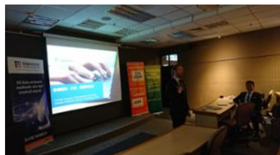
Co-sponsored by Blancco and supported by CSA Taiwan Chapter, CSA Interaction was organized in Taipei. This session guided the best practices and technology available to