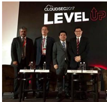
Expert Forum Panel on "Level up your Cloud Security 2017"